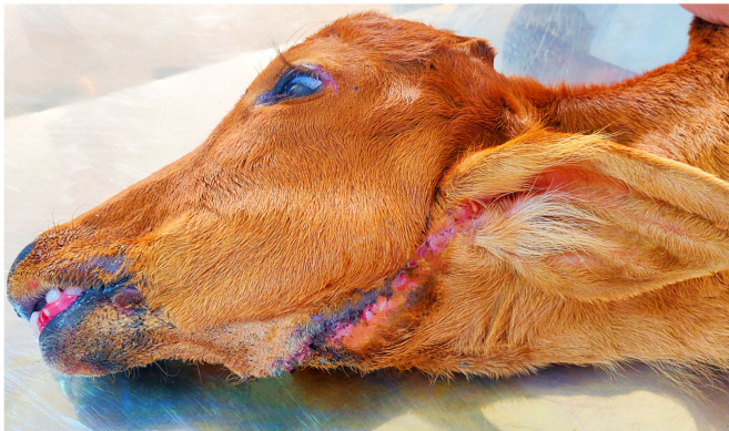
Figure 3. The calf after the removal of skin stitches on the 14th postoperative day.

to prevent myiasis, and proper hygiene of the animal shed was ensured.