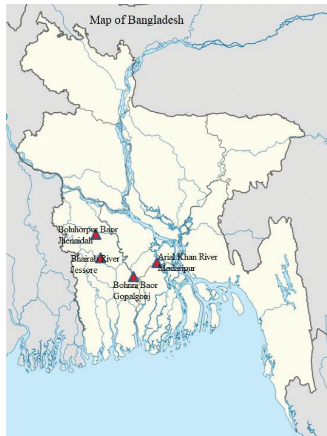
Figure 1. Map of Bangladesh showing collection locations of X. cancila from four freshwater sources.

In total, seven meristic characters, namely number of teeth on upper jaw (TOU), number of teeth on lower jaw (TOL), number of dorsal fin rays (DFR), number of caudal fin rays