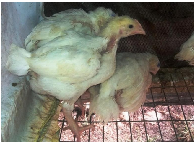
Figure 1: Four week-old broilers infected with IBD virus showing ruffled feathers and unthriftiness.