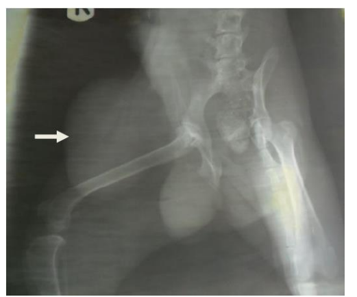
Figure 1: Abdominal Radiograph showing the enlarged testicle (arrow)