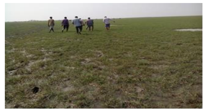
Figure 5. Swampy island not be suitable for cattle raising confirmed through transect work.