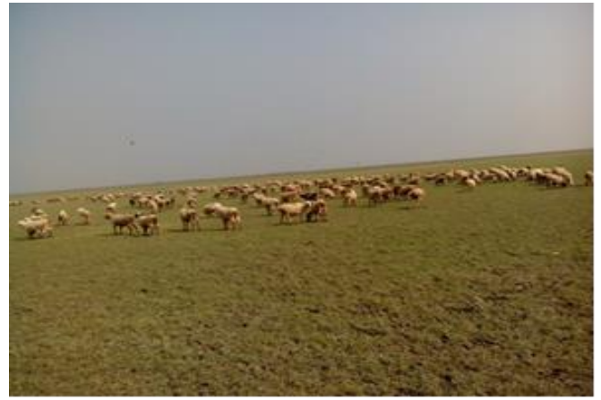
Figure 3. Sheep freely roaming in this island.