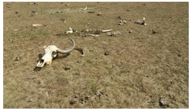
Figure 6. Remnants of died livestock was found during transect work in the island.

Cross and Murrah) in the island. Informants identified and ranked diseases in each livestock species using SR tool, for example, Peste des Petits Ruminants (PPR), Foot and Mouth Disease (FMD), and Parasitic infestation as the diseases of Sheep; Anthrax, FMD, Liver fluke infestation (LFI), and Haemorragic Septicemia (HS) as the diseases of cattle; HS, LFI, FMD, and Anthrax as the diseases of buffalo. Ranking of diseases were performed using simple ranking tool, while proportional pilling tool further provided to breakdown in percentage of livestock population ( Figure 2 ), livestock breed (specieswise) and livestock disease (species-wise) ( Table 2 and 3 ) of the island.