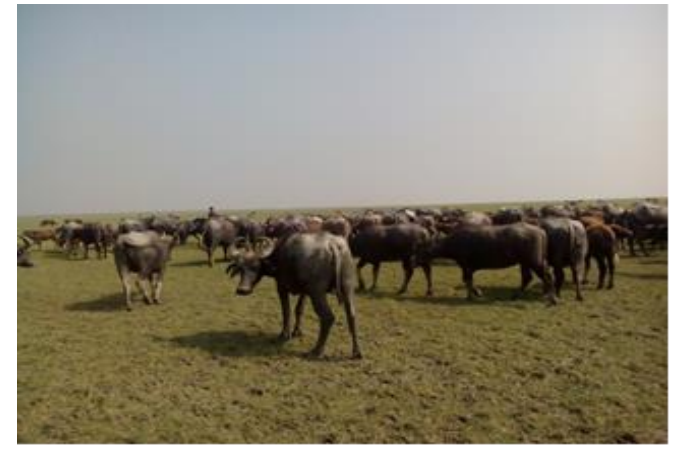
Figure 4. A buffalo herd freely roaming for searching feed.