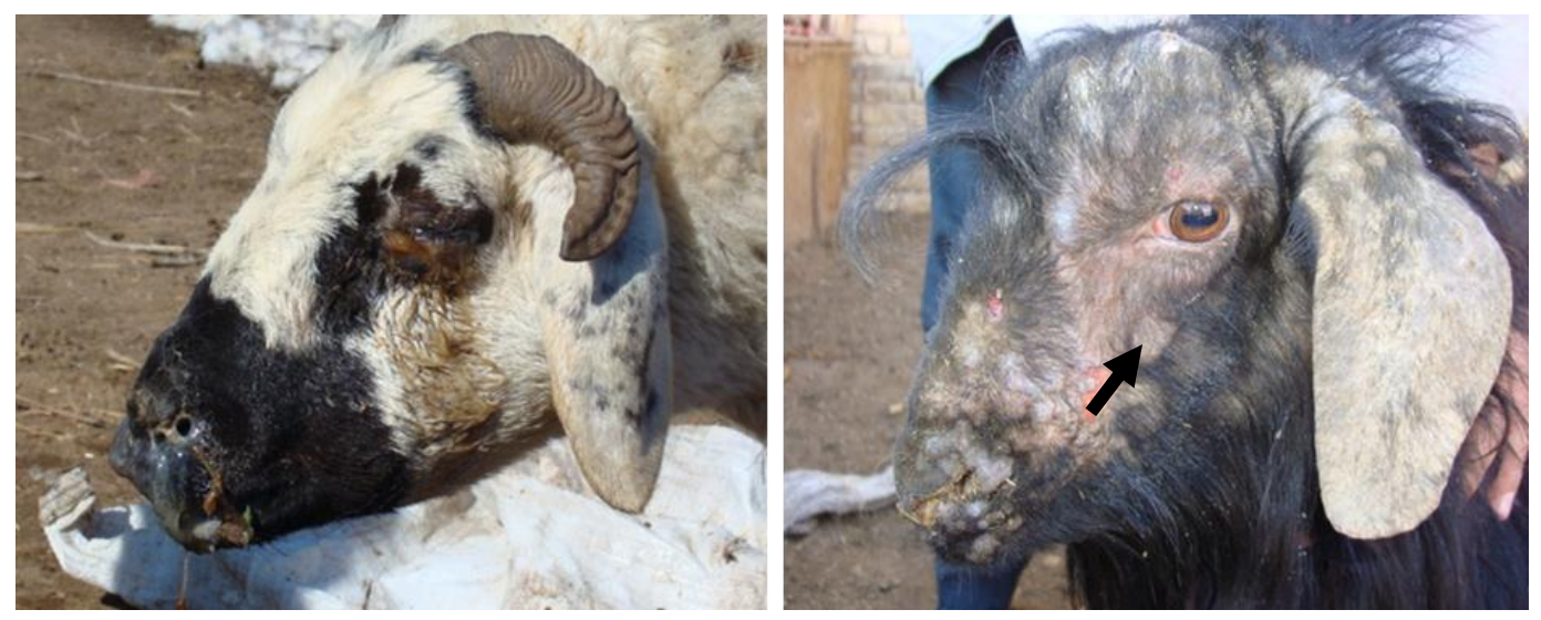
Figure 3: Swelling of nostrils and thick discharges from the nose and eyes (left), Pox lesions on the face and ears (right), Qom, Iran.

Oman naturally infect both goats and sheep. Therefore, in most countries, at least two different vaccines containing the isolates of either GP or SP virus, are necessary to protect small ruminants against both virses (Carn, 1993; Rao et al., 2000; Abu-Elzein et al., 2003; Radostits et al., 2006; OIE, 2013; Iran Veterinary Organization, 2014). However, recent studies have confirmed that the identity of Kenyan SGP vaccine (commonly used vaccine) virus O-240 is not SP virus, and this vaccine may cause clinical disease (Tuppurainen et al., 2014). Furthermore, researchers have recently reported some SP outbreaks occurred in both sheep and goat flocks at roughly the same