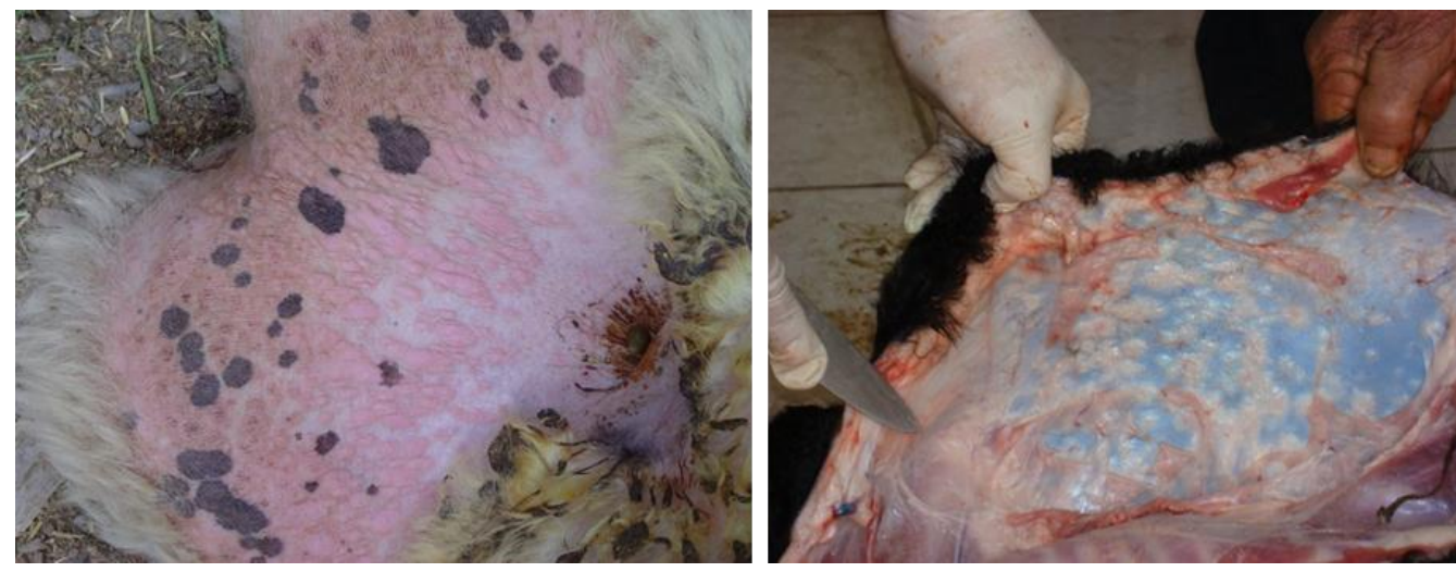
Figure 2: Depreciation of wool and skin quality, Qom, Iran.