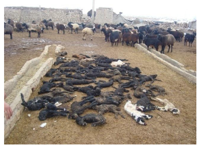
Figure 1: High mortality rate due to SP outbreak, Qom, Iran.

ruminants are most severing pox diseases of domestic animals. In susceptible herds, morbidity is 75-100% and case fatality, depending on the virulence of the virus, is between 10-85% in the outbreaks ( Figure 1 ). Mortality in older animals can reach up to 90% when capripox is superimposed on another viral condition such as peste des petits ruminants (PPR). Breeds of sheep and goats originated from Europe are very susceptible to capripox, and mortality may reach up to 100% (Kitching, 1986; Radostits et al., 2006; AHA, 2011). Mondal et al. (2004) reported that Sheep of the Rambouillet breed was highly susceptible to infection as compared to Australian cross and American Merino breeds (Mondal et al., 2004).