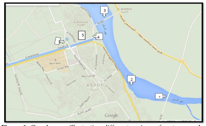
Figure 1: Google map illustrating different regions of water sample collection. 1- Al-Wasta Bridges , 2- The area facing to Al-Helaly Street, 3- Al-Khazan Bridge, 4- Al-Baladya Club Bridge, 5- 25th January Bridge, 6- Al-Azhar Bridge.

Sample collection: A total of twenty seven surface water samples were collected from different regions of Nile River and Al-Ibrahimeya Canal in Assiut Governorate, Egypt (Figure 1). The water samples were collected in accordance with the standard methods for the examination of water and wastewater (APHA, 2005).